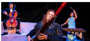
SOUND SYMPHONY SCOTLAND