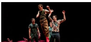
THE PROBLEM WITH PINK CANADA AND FRANCE