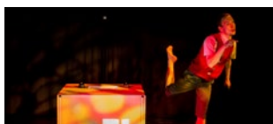
HERMIT THE NETHERLANDS