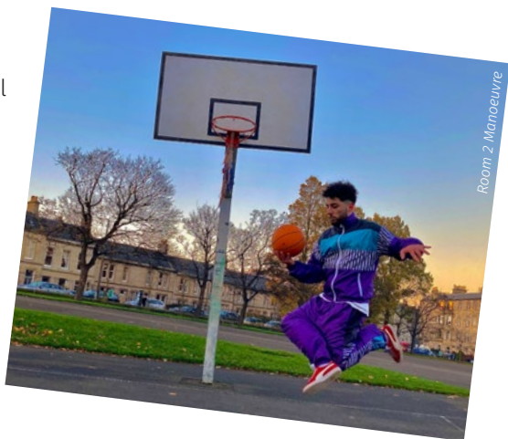
Room 2 Manoeuvre

Family Encounters is supported by EventScotland through Scotland's Events Recovery Fund (SERF).