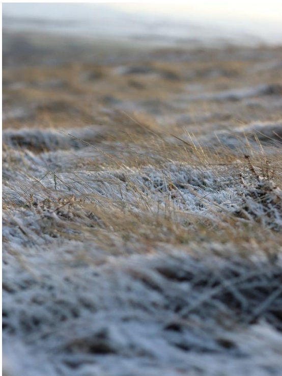
A close up image of brown grass poking through snow and frost taken from close to the ground. The grass is lit by the sun and it and the snow sparkles. In the distance more grass continues off into the distance.

Research for the seed idea for performance I came to the fellowship with, has moved between writing, dancing, filming the wind in landscapes, photography, conversations, reading, listening, walking, moving, aiming to consider a wide and diverse range of thought around our varying relationships to landscape, ecology or the natural world from the political to the sensory and all that is overlapping. I also aimed to disrupt hierarchies, in many senses of the word, of the senses and of 'accepted' behaviours or movements. Laying the vertical onto its side. Laying down with it, at its different parts. Seeing where we grow and what we grow from, what we must tend, where we must listen and where we must lead. Learning from those who do this already. Questioning things like working from the audio/hearing/sound first to create show/visuals/choreography, rather than visuals first and audio describe after? Wondering what else makes choreographies other than creating for visual interest in performance? A second blog will explain these reflections more.