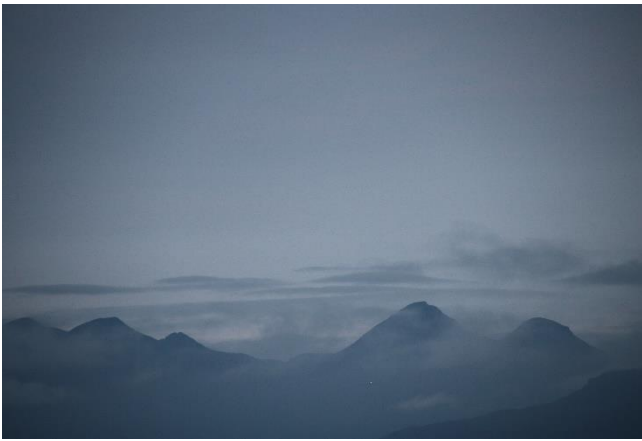
At dusk and under a grey blue light, the tips of faraway mountains are softened by wisps of mist and cloud