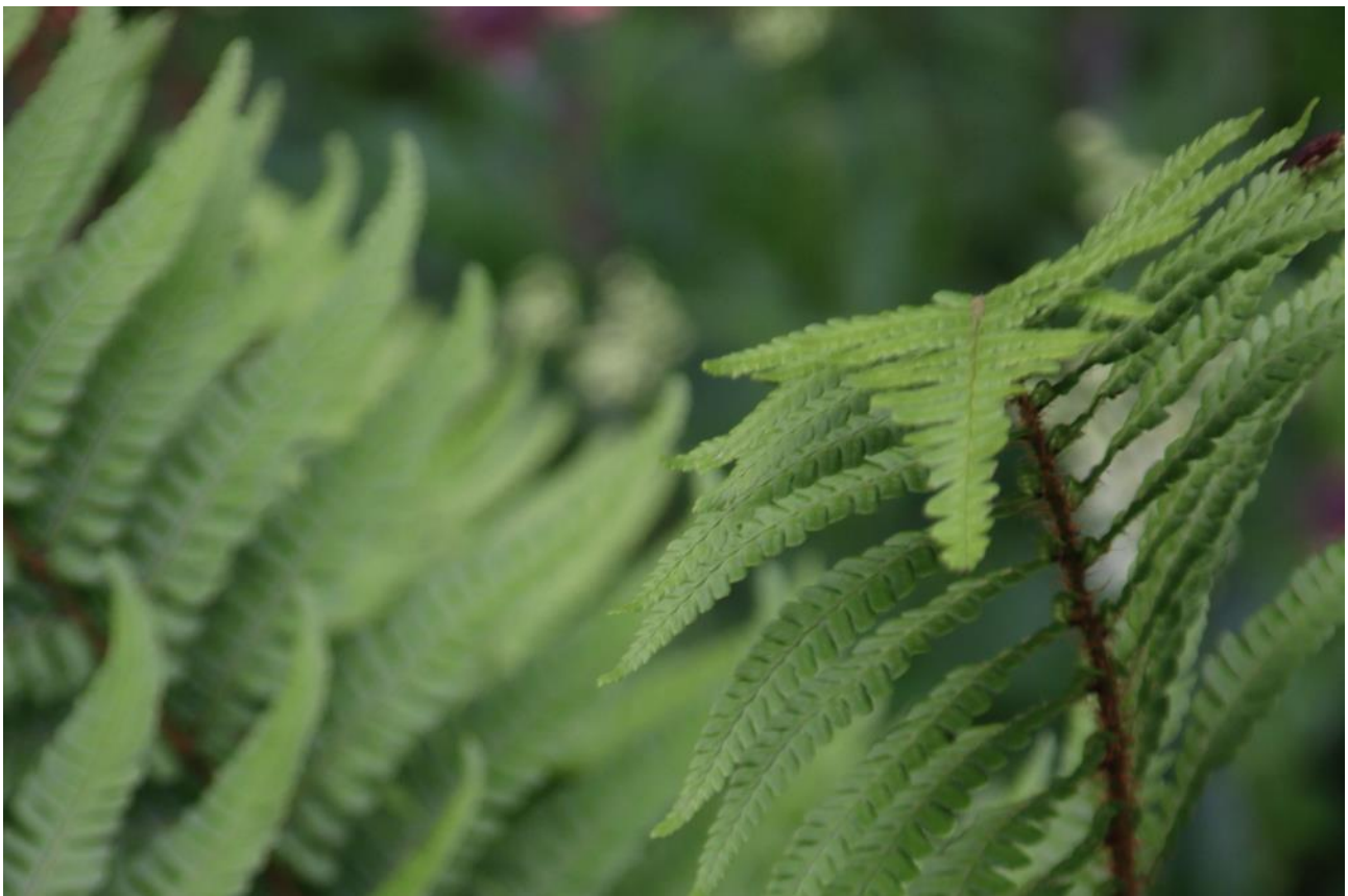
A close up of very green ferns. Spiky green leaves curl to the left, as another leaf which is more in focus curls towards the camera. Their stems are brown. They are soft but spiky with individual leaves picked out by the light and shadow.

"So how do people with autism see the world, exactly? We, and only we, can ever know the answer to that one! Sometimes I actually pity you for not being able to see the beauty of the world in the same way we do. Really, our vision of the world can be incredible, just incredible ..." (p55)