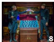
CABINET OF MIRACLES