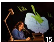
THE YELLOW CANARY