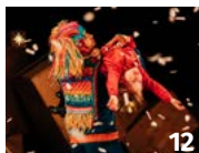
THE UNEXPECTED GIFT