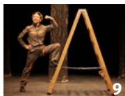
AN ANT CALLED AMY