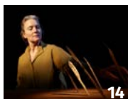
SUPPOSE YOU HAD A PORTABLE GRAMOPHONE