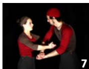
BY TRIAL AND ERROR