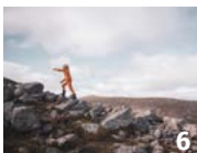
SO FAR SO GOOD