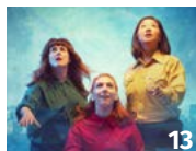
SHŌ AND THE DEMONS OF THE DEEP