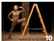
AN ANT CALLED AMY