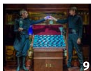
CABINET OF MIRACLES