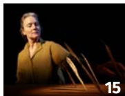
SUPPOSE YOU HAD A PORTABLE GRAMOPHONE