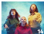
SHŌ AND THE DEMONS OF THE DEEP