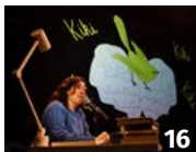
THE YELLOW CANARY